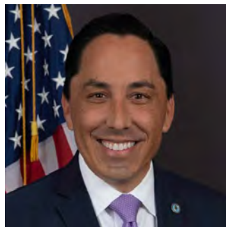
TODD GLORIA Mayor City of San Diego